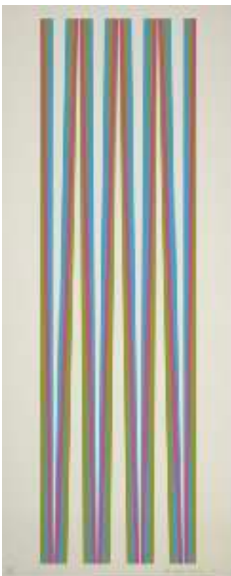
Bridget Riley Elongated Triangles 5 Collection: Tate, London